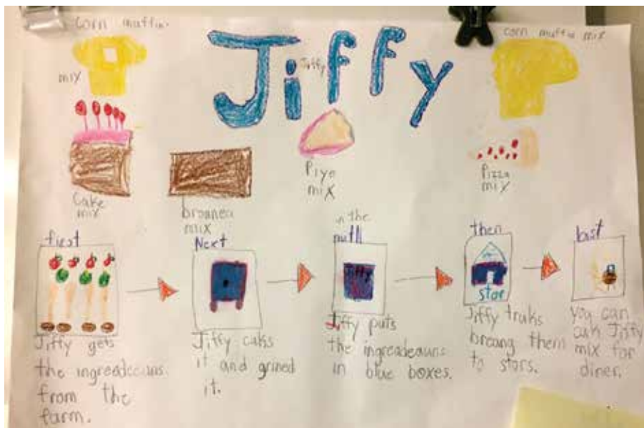
Figure 1: Draft Flier for the Economics Project

Our approach, tailored for the primary grades, followed several of the typical